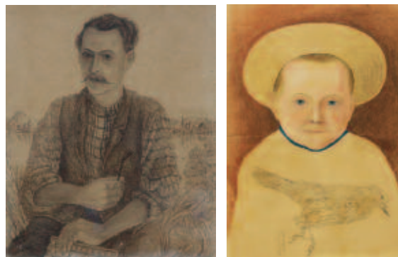
Adolf Dietrich, Self-portrait with Accordion / Selbstbildnis mit Handorgel , 1906 Portrait of a Boy / Knabenportrait , 1909